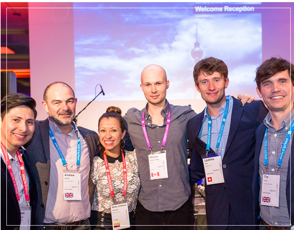
Educators, agents and a service provider at the ICEF Berlin Welcome Reception

Another highlight of the workshop was the soft launch of the new Irish Education Agent Course developed by ICEF in collaboration with a national advisory board of educators, agents, and other stakeholders. The purpose of this online course is to ensure that agents have accurate, up-to-date information about the Irish education system and know how to best advise students on study in Ireland. ICEF offers a variety of other courses, including the ICEF Agent Training Course which recently celebrated a milestone of 1 000 graduates from 103 countries worldwide. For more information on the ICEF agent training courses, please visit http://www.icef.com/en/icef-agent-training/ .