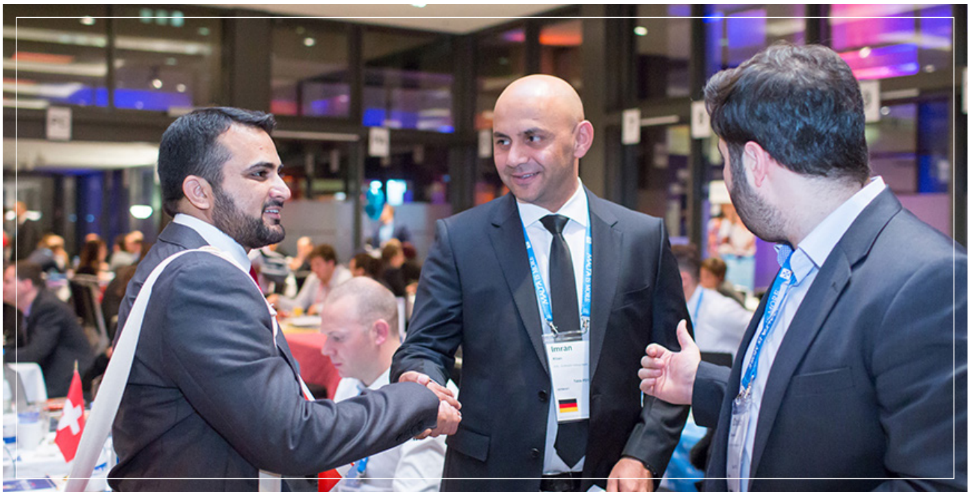
A business meeting during the 2016 ICEF Berlin Workshop

The ICEF Berlin Workshop had another record-breaking year, hosting the largest-ever number of one-to-one business meetings. Over the course of the three-day workshop, 1 583 organisations from 100 countries came together to network, learn, and build meaningful connections through 27 267 onsite business meetings. Among the 2 444 participants 1 032 were education agents and 1 412 were educators, service providers, industry associations, or work and travel organisations.