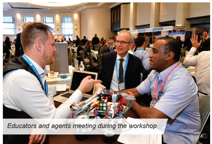
Educators and agents meeting during the workshop