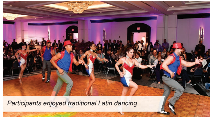
Participants enjoyed traditional Latin dancing