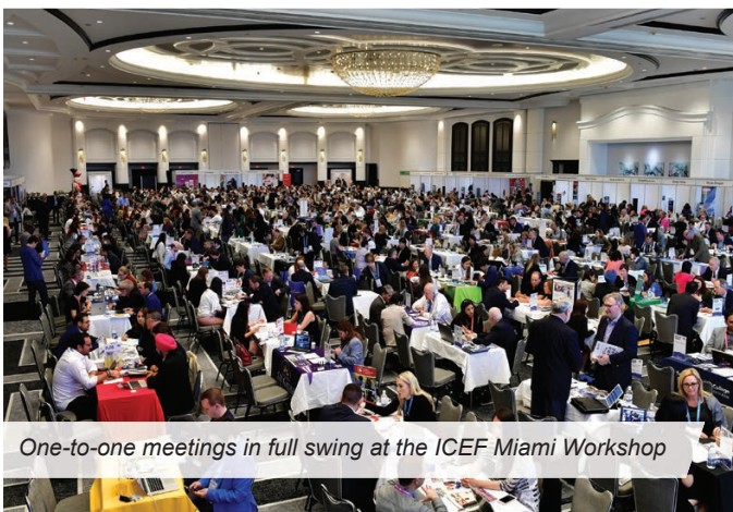
One-to-one meetings in full swing at the ICEF Miami Workshop

The 2018 ICEF Miami Workshop will be held at Loews Miami Beach Hotel between 10 and 12 December. To find out more about this event and how to register, please go to: http://www.icef.com/en/workshops/icef-miami-workshop/