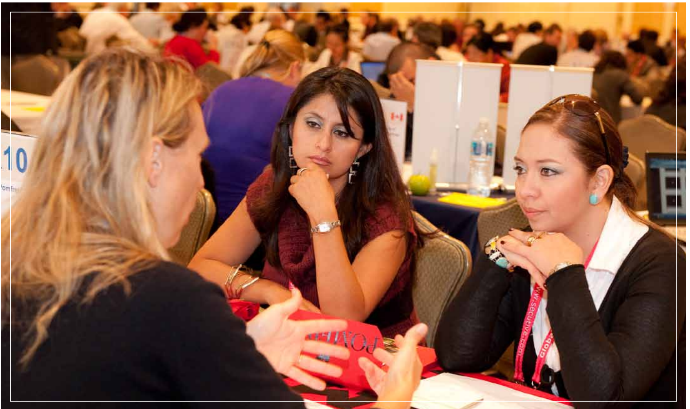
An educator - agent meeting

Satisfaction remains high as the North America Workshop expands