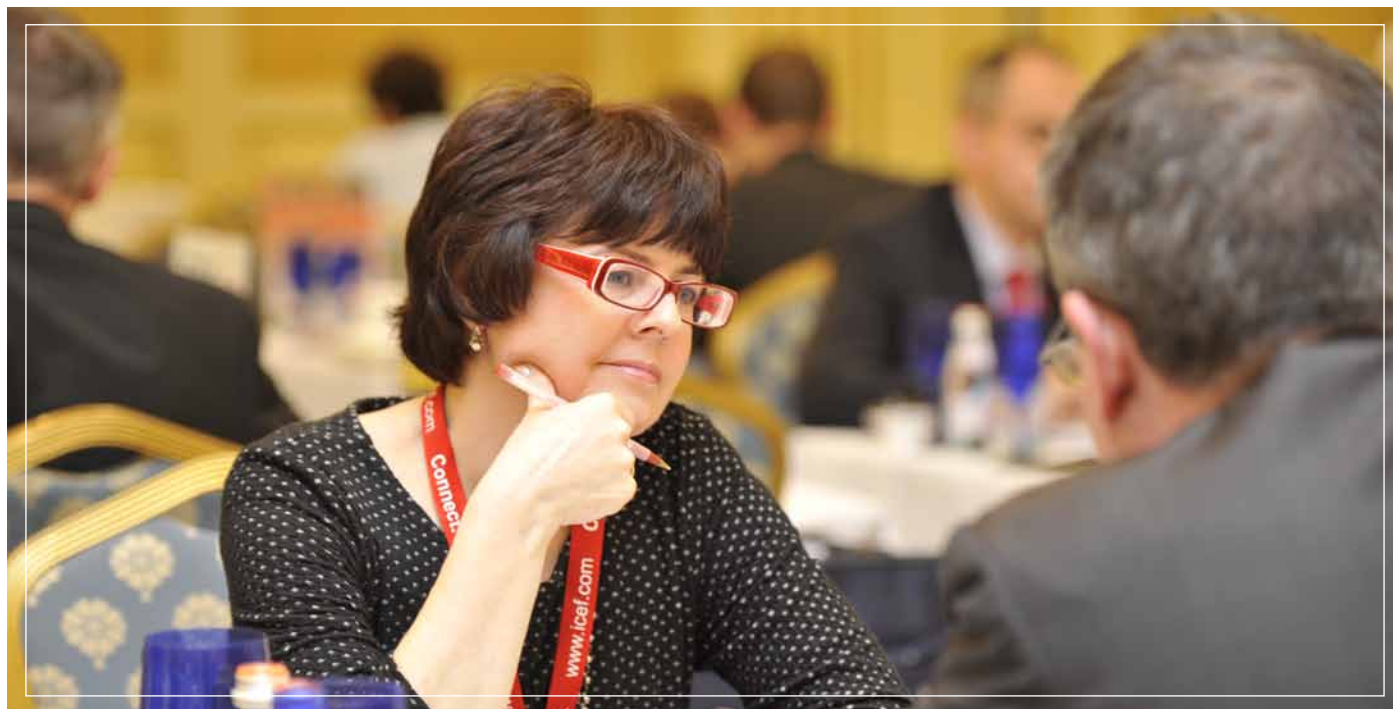
An educator-agent meeting

The number of workshop participants at the 2011 ICEF Moscow Workshop grew by 15%, making it the largest ever to date. With an 18% increase in the number of educators at the event, the Moscow Workshop continues to reflect the strength of this important student market. Held from March 25 - 27, representatives from 124 educational institutions around the world met with 220 quality agents from Russia, Eastern Europe, Central Asia and the Caucasus. Overall, 96% of the participants rated the event as good or excellent, the two highest categories.