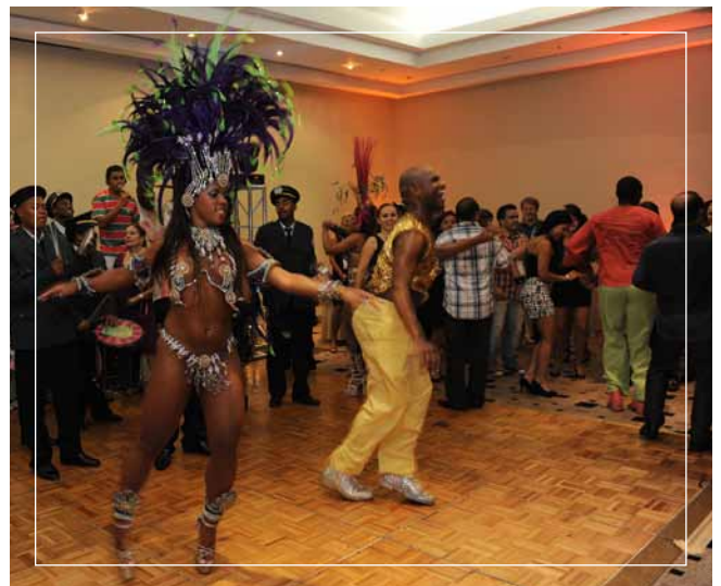
Participants enjoyed a performance by the Mangueira Samba School