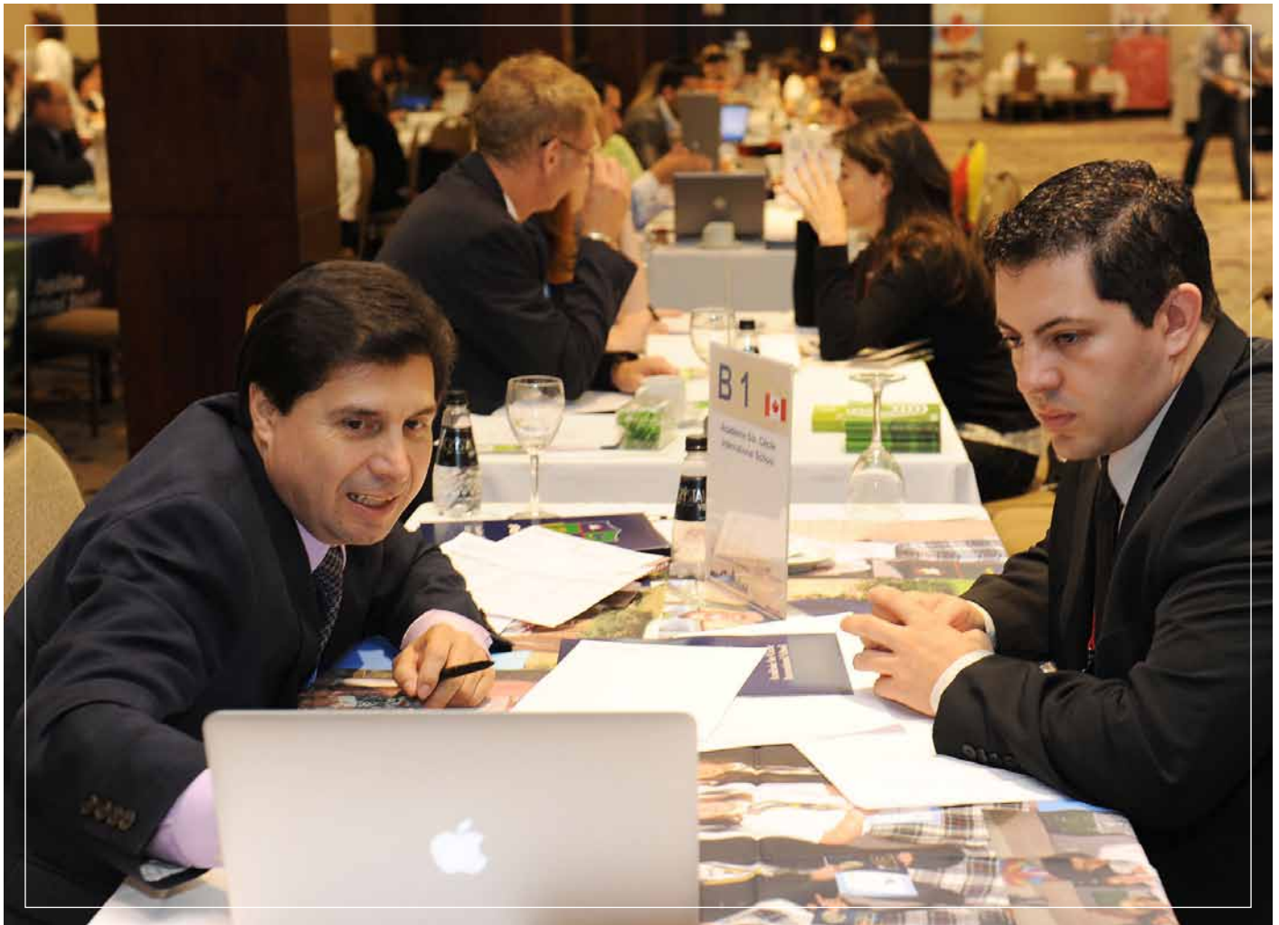
An educator-agent meeting

Over 25% growth at the ICEF Latin America Workshop