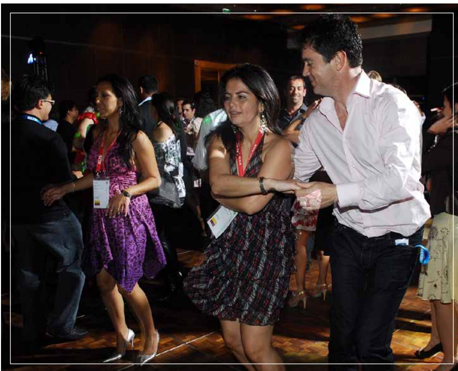
Participants enjoy dancing at the Evening Reception