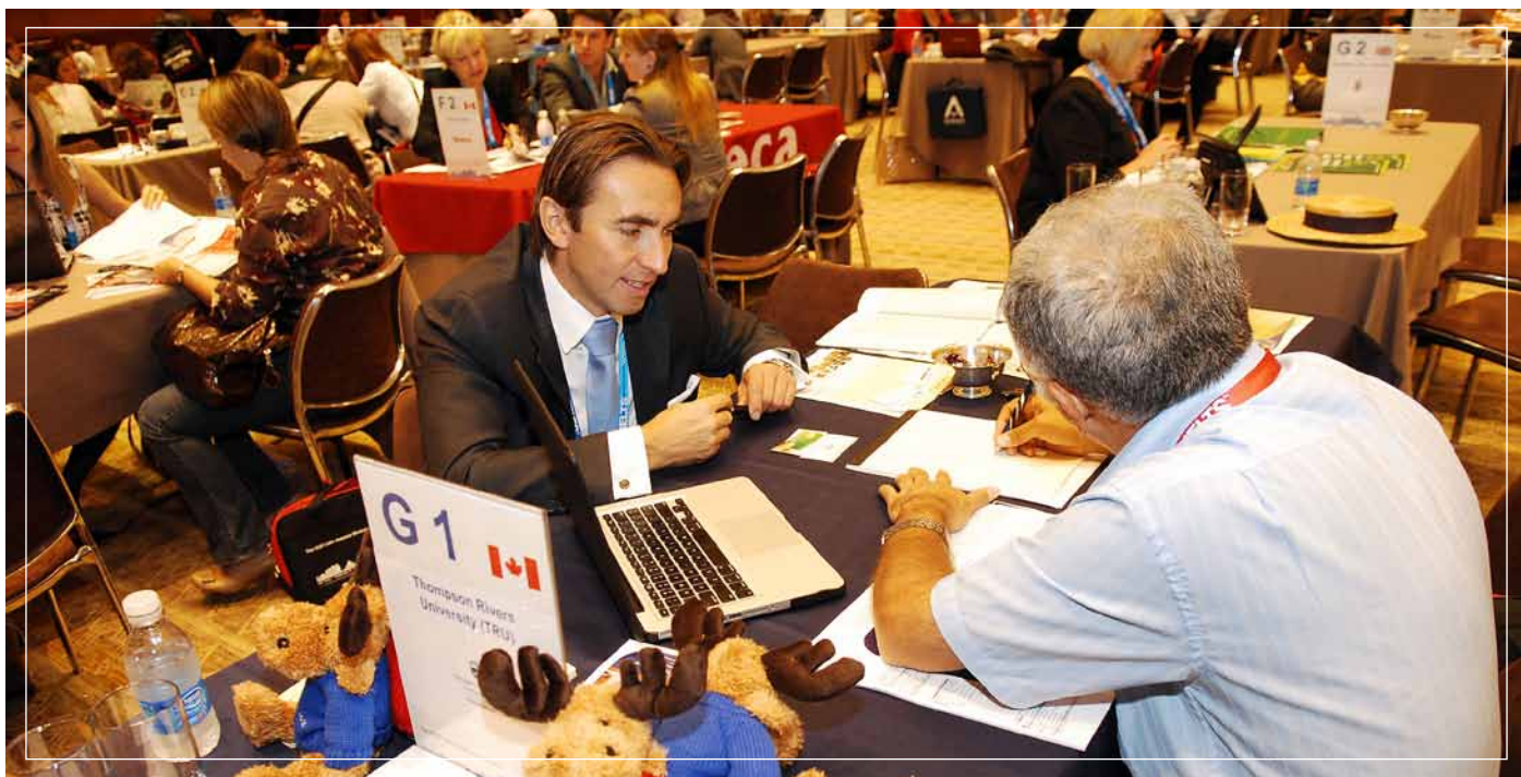
Networking at the ICEF Latin America Workshop in Sao Paulo

Satisfaction high as Latin America Workshop grows 11%