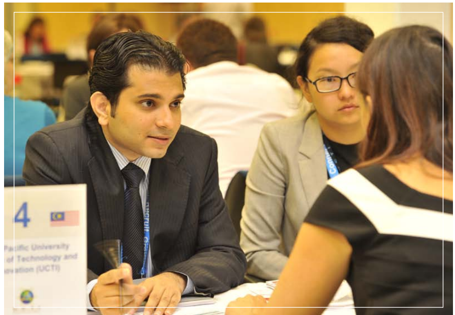
An educator-agent meeting

In total, over 1600 pre-scheduled meetings took place between educators, higher education-focussed agents and related service providers.