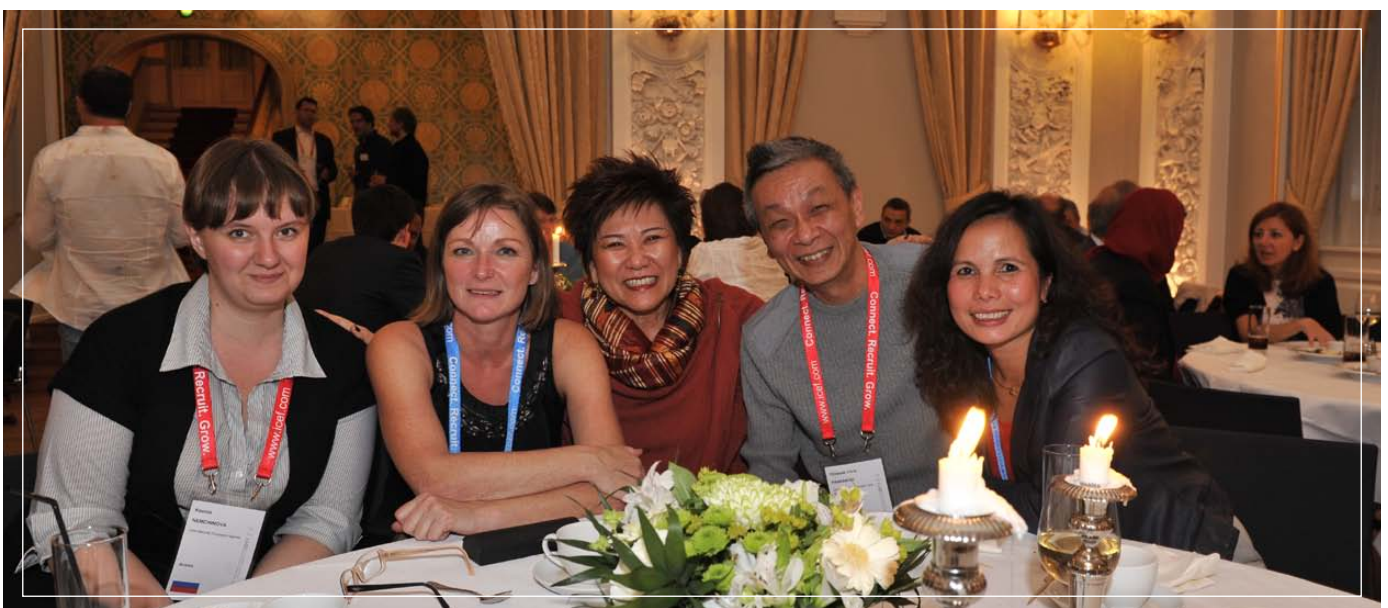
Informal networking at the Evening Reception