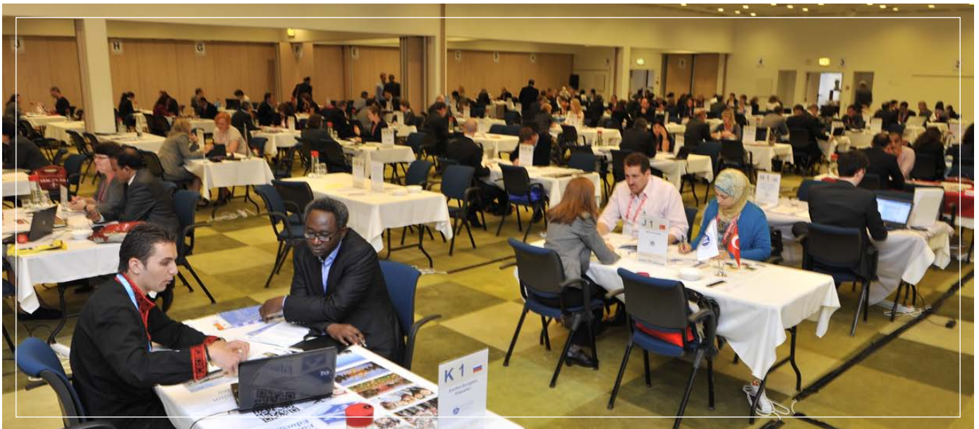
The meeting hall at the ICEF Higher Education Workshop