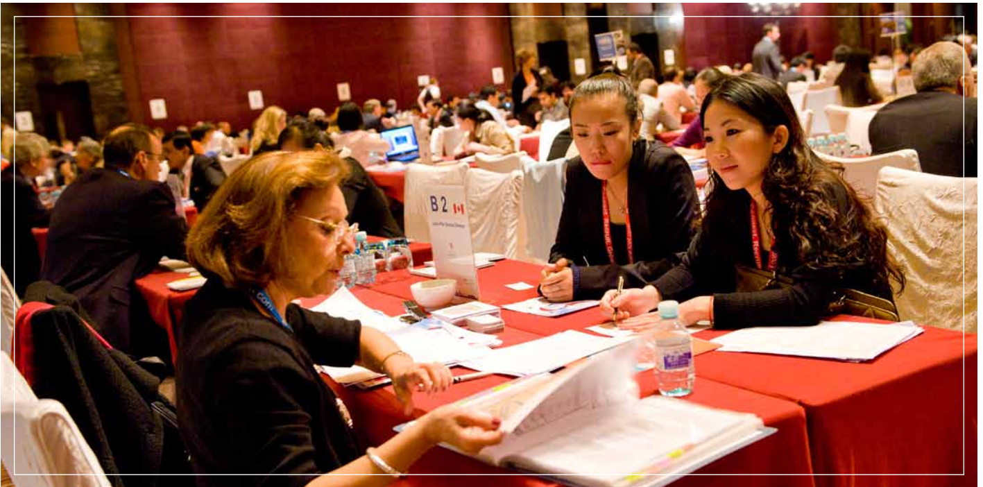
An educator - agent meeting

The 2010 ICEF China Workshop recorded dramatic growth in overall attendance (20%) , educator registrations (27%), and agent participation (22%) over the previous year. Held October 13 - 15 in Beijing, the event hosted 165 educators representing 118 institutions in 25 countries and 184 quality student recruitment agents from China, India, Taiwan, Nepal, Mongolia, South Korea, and 26 other countries around the world.