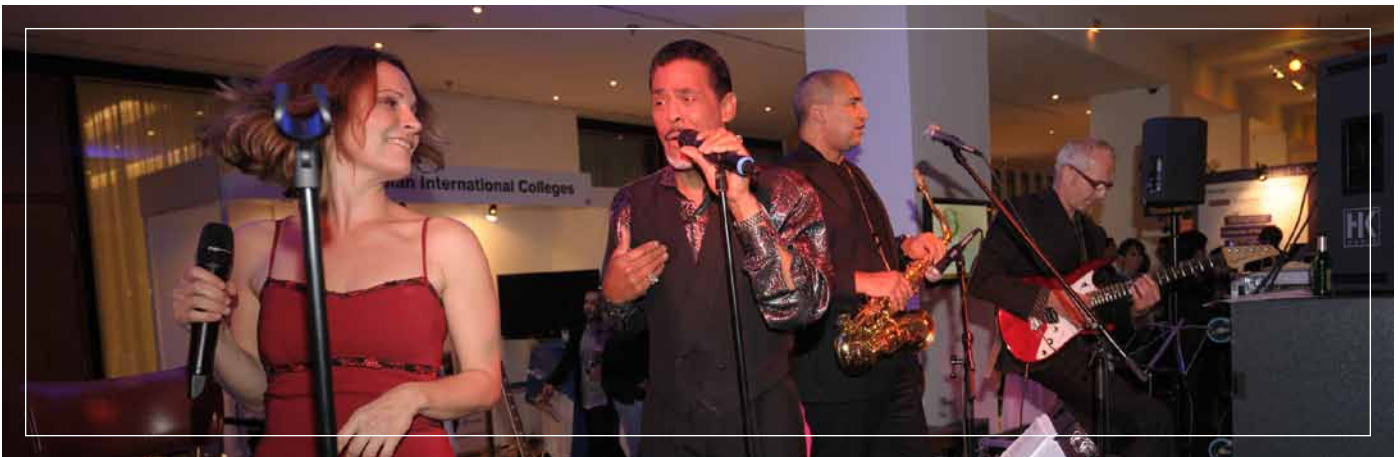
The live band at the ICEF Berlin Party

The ICEF Berlin Workshop always offers a comprehensive seminar and presentation programme on registration day. This year, 39 seminars/presentations were held and included topics ranging from the results of the ICEF Agent Barometer, online marketing, entrepreneurship and innovation, and finding the most suitable agencies for your institution. In addition to the seminar programme, various associations, including ALTO, GAELA, FELCA, IALC and AREA utilised this day to hold their annual meetings.