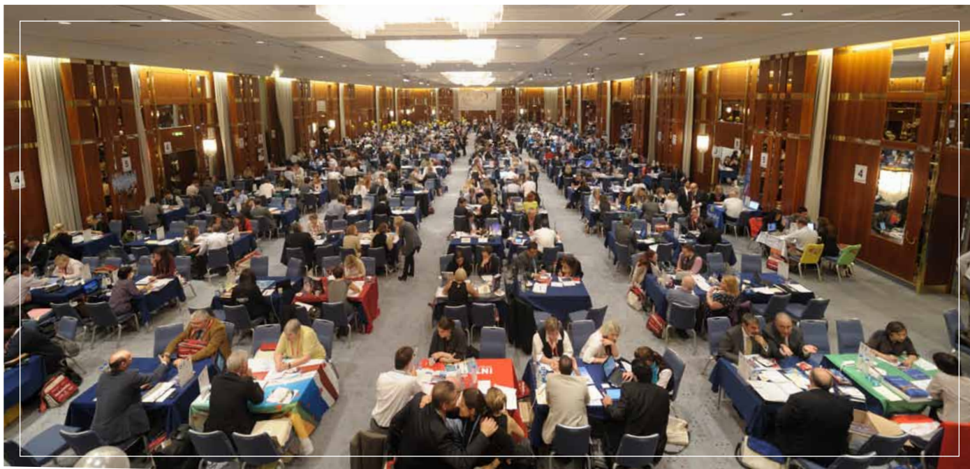
One of the meeting halls at the ICEF Berlin Workshop

For the seventh consecutive year, the ICEF Berlin Workshop has grown, this year by 7% over 2010, proving itself to be the world's largest and most international education-focussed networking event .