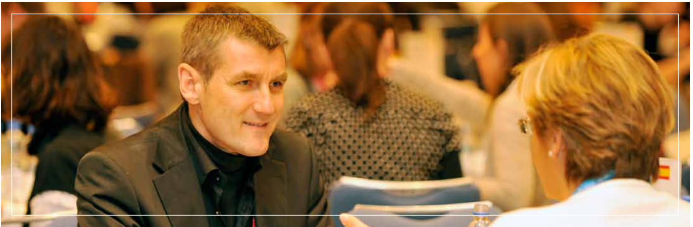
An educator-agent meeting

The ICEF Berlin Workshop always offers a comprehensive seminar and presentation programme on registration day. This year, 39 seminars/presentations were held and included topics ranging from the results of the ICEF Agent Barometer, online marketing, entrepreneurship and innovation, and finding the most suitable agencies for your institution. In addition to the seminar programme, various associations, including ALTO, GAELA, FELCA, IALC and AREA utilised this day to hold their annual meetings.