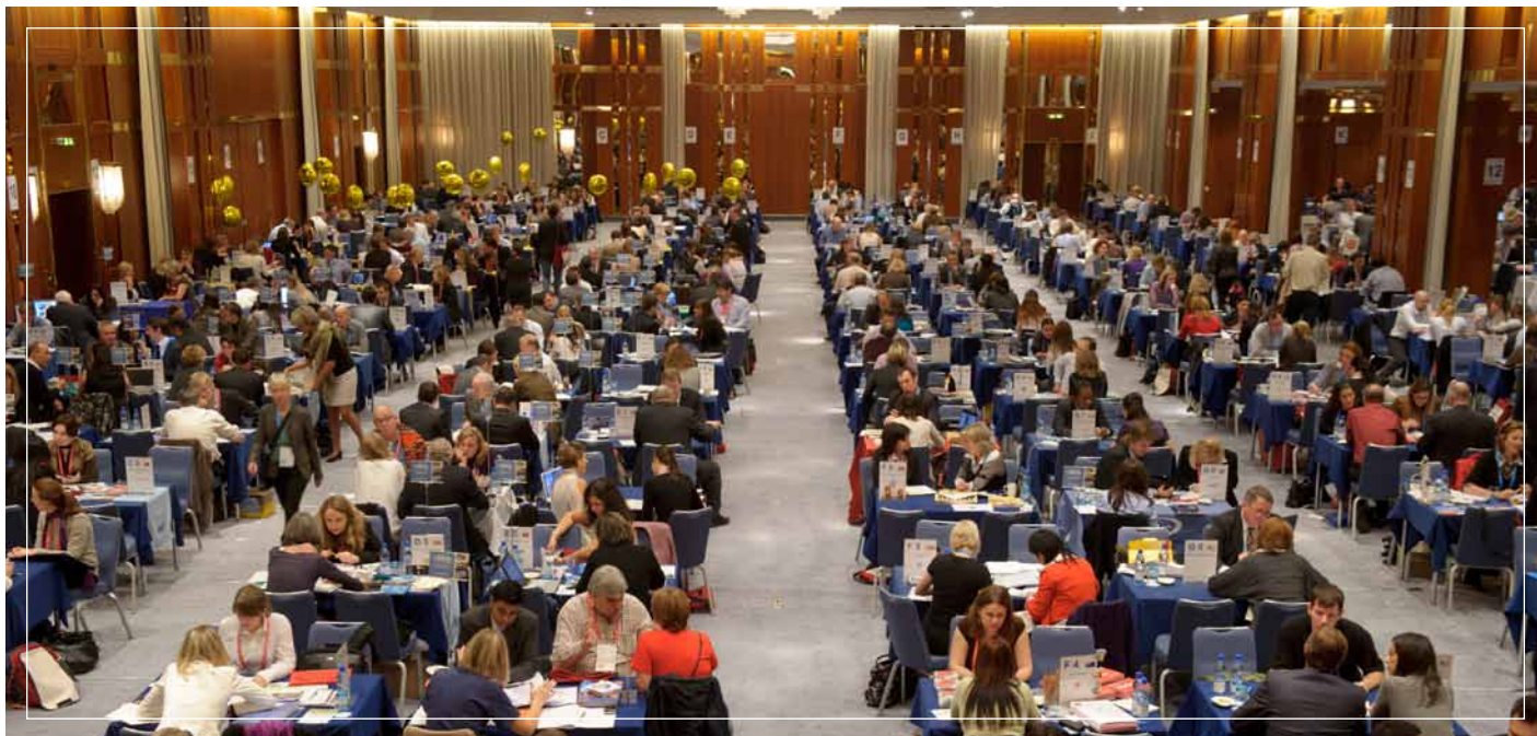
The ICEF Berlin Workshop

The ICEF Berlin Workshop grew by 4% in 2010, once again making it the largest ever ICEF event. International educators from 485 institutions , 23 work and travel organisations , 61 exhibitors and 837 ICEF-screened agents from 86 countries around the world came to Berlin for the 2 and a half day workshop. Overall, 98% of participants rated the event as good or excellent, the highest possible ratings.