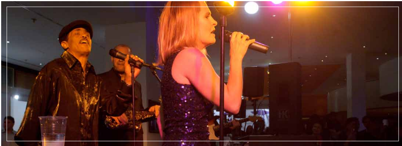
The band gets the party started at the 2010 ICEF Berlin Workshop

Informal networking is an important part of ICEF events. Mealtimes, breaks and social gatherings allow participants to maximise their time through additional informal discussions. The ICEF Berlin Party was the social highlight of the event and included a sit down dinner, live band, DJ, and dancing in the winter garden of the InterContinental.