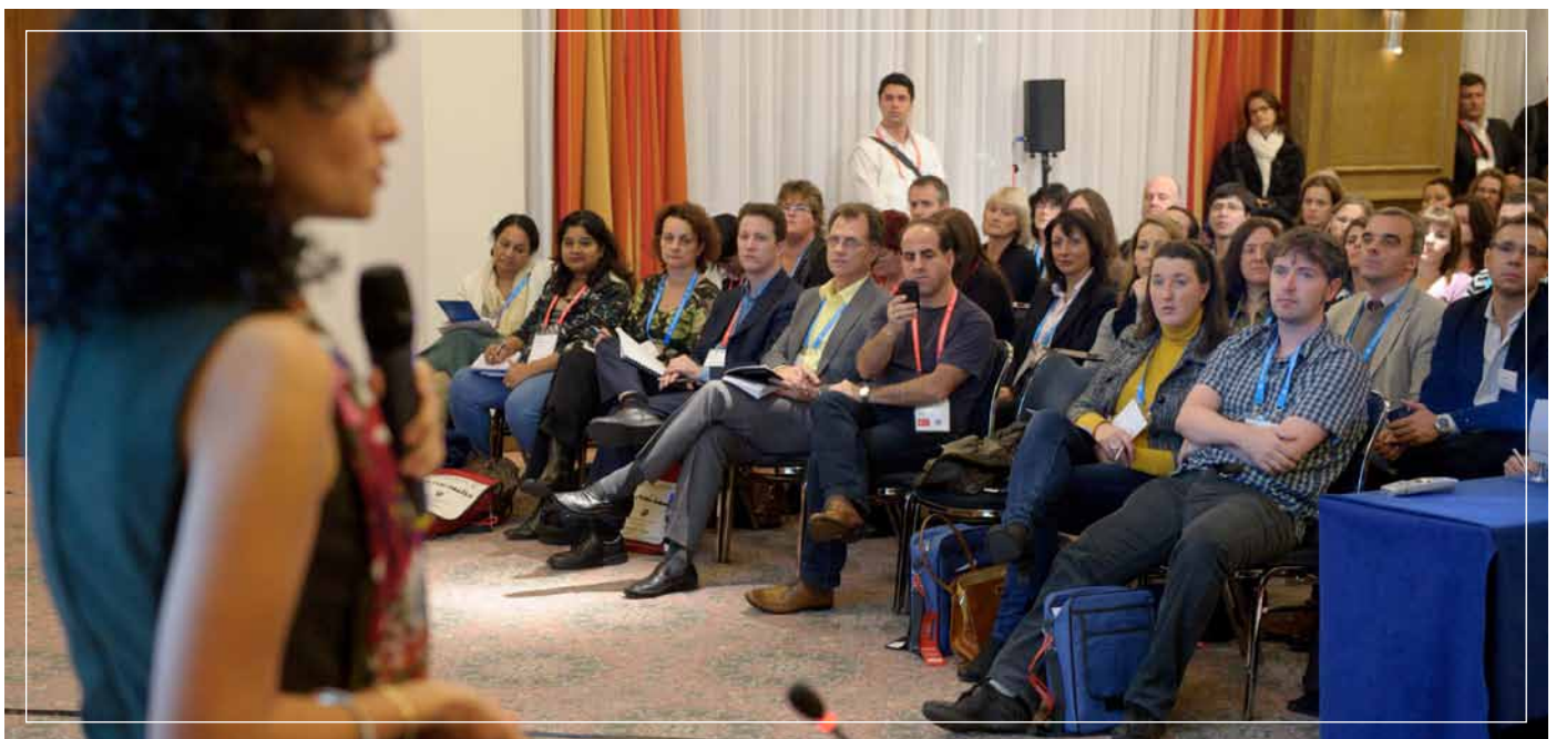
One of a number of seminars at the ICEF Berlin Workshop