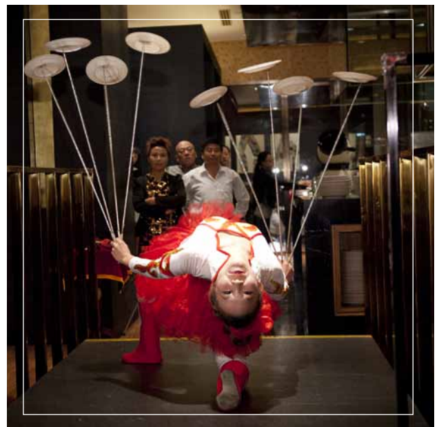
Participants enjoyed a variety of traditional entertainment