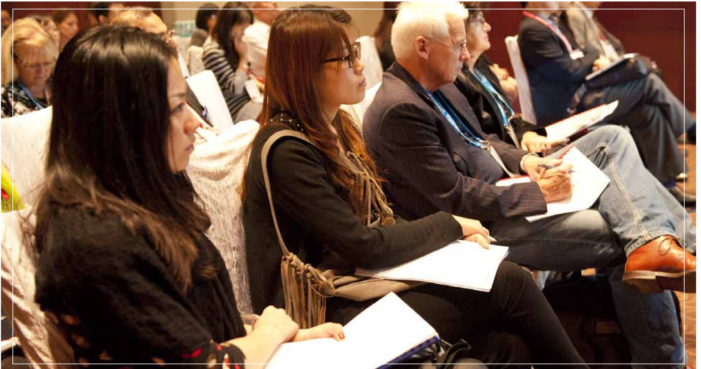
One of a number of seminars at the ICEF Asia Workshop