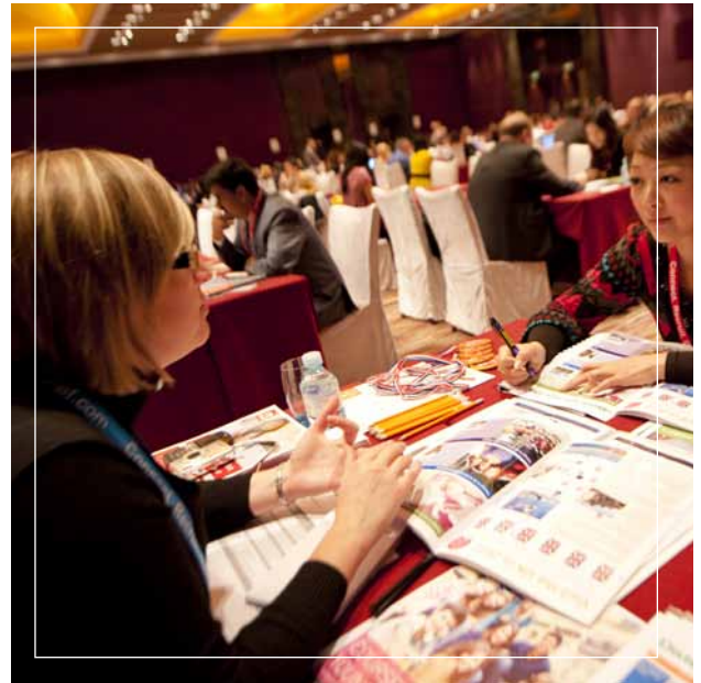
An educator - agent meeting at the ICEF Asia Workshop