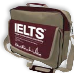
Branded workshop bag